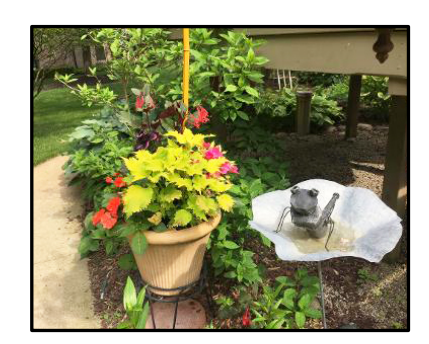
Above: Summer scene from a Rochester member's garden

Left: Memories of Rochester Garden Club's 2019 garden walk