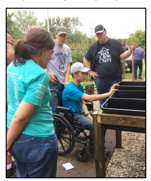
Eagle Scout's project includes wheelchair accessible raised gardening area